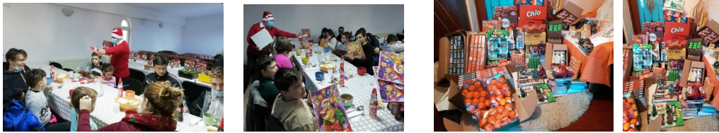
St Nicholas day for Children 2020 Suceava

At both Easter, St Nicholas day and Christmas again despite the pandemic St RCHF aided by the Charmant family and very kind Romanian sponsors again brought smiles to the faces of the poorest of children, including orphan ones, the homeless and old aged people living alone.