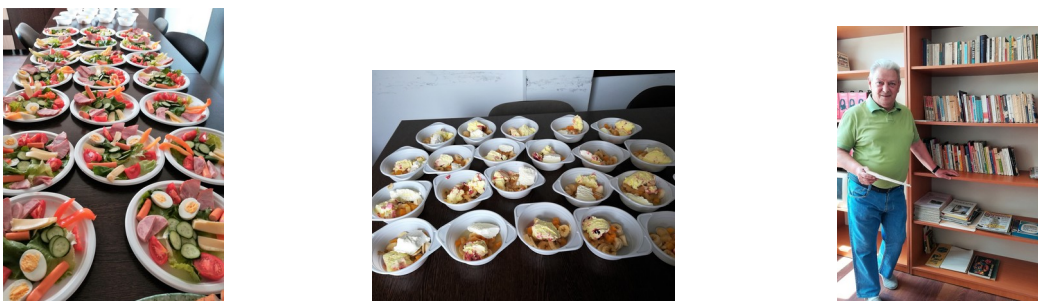
Children's day event meals and the donation of books placed in the village Library

Unfortunately this year for the 1 st time in the last 10 years we were unable to make our summer camps for children, but did make several day events including a full meal for children in poor families at each event as well as sports activities. We were given a donation of library books which we donated to a village center in which children take a book on a library style basis home to read and return same.