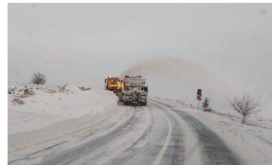
Back to school basics sponsored and delivered free to needy children by St RCHF despite poor conditions on the roads January 2020

By February many a person started to fall ill with respiratory illness's but nothing serious was thought of this in Romania a Country where are huge amounts of tuberculosis and bronchitis sufferers. Then mid month all changed when it was realized that a new severe respiratory illness had developed very quickly and had spread from where it was thought to have originated from in the province of Wuhan in China. This theory has been broken down though as is now known that the infection known and named as Sars Covid 2 which caused the Covid 19 illness was in fact present the December of 2019 even in Europe including in Italy but had not been diagnosed as a new type of infection or illness. That was where China came in and made the discovery and here confusion reigned as to its original origin, much fuelled by an international trade war between the then president Trump of US and China with a great deal of untruths included.