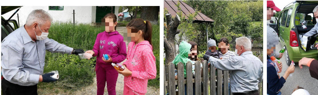
Delivering treats to children and sanitary products at Easter in Vaculesti village, Botosani County

Likewise in collaboration again with the pulmonary disease hospital of Iasi we as a Humanitarian foundation made a presentation again at the prestigious INSPIR medical conference, which was this year an online event, and at the TB Reach conference online at Borstal in Germany.