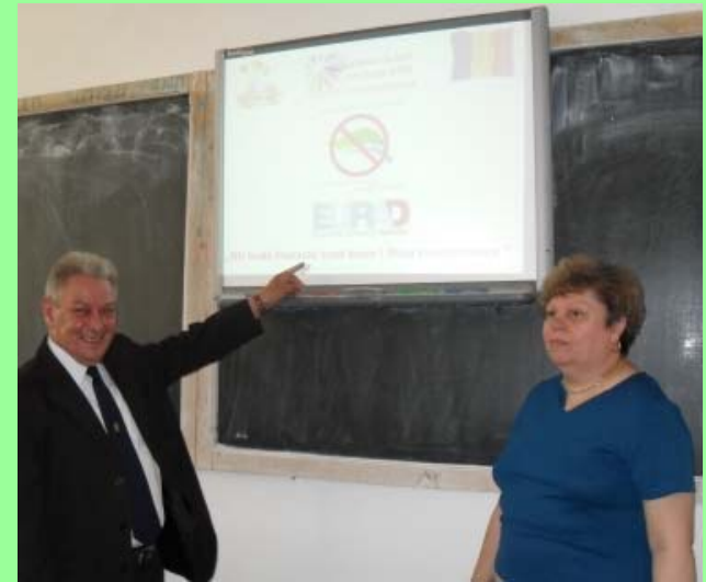
Students at the RCHF 2011 Anti drug conference and workshop