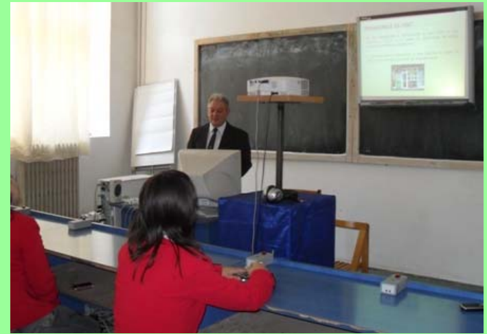
“Vasile Lupu Iasi” high school students making group decisions in the RCHF anti drug Iasi workshop 2011