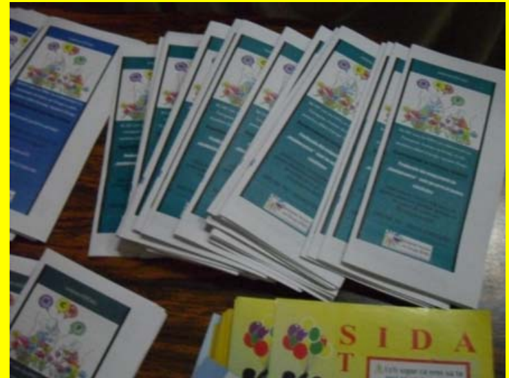
Young peoples workshop group – RCHF Anti Drug pre event publicity – range of RCHF anti drug brochures